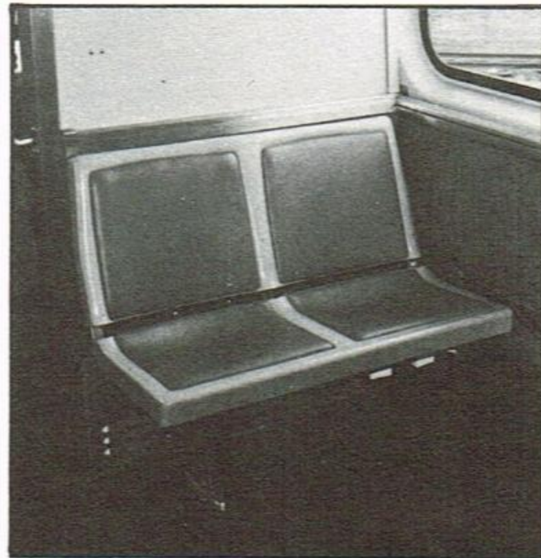
Comfortable padded vinyl seats in fiberglass shells.