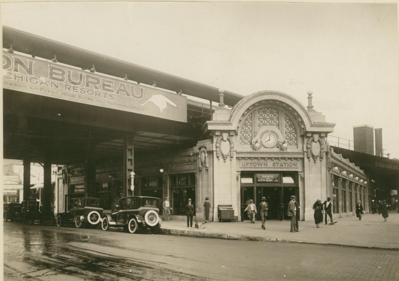
Interior view of Uptown Station showing stairway to trains.

This modern station, equipped with every convenience for the use of the public, is used jointly by the North Shore Line and the Elevated Railroads. It was an improvement much needed by the North Shore Line to accommodate its growing business in that district.