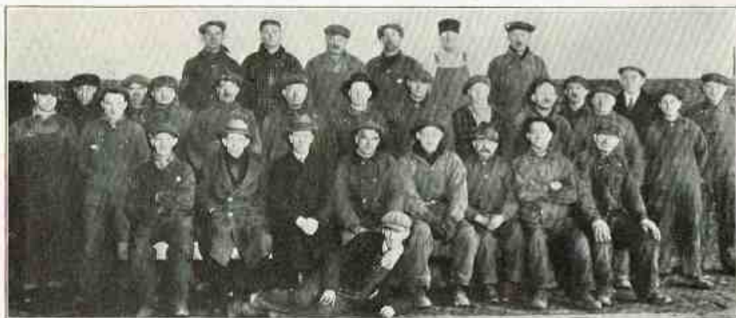
Again Leaders in Pull-in Contest