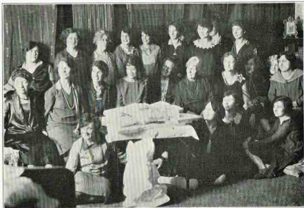
This Shower Was Dry