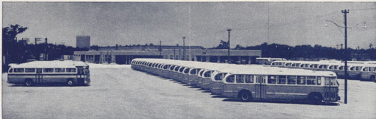
Part of the storage area of CTA's new terminal where as many as 350 buses can be parked.